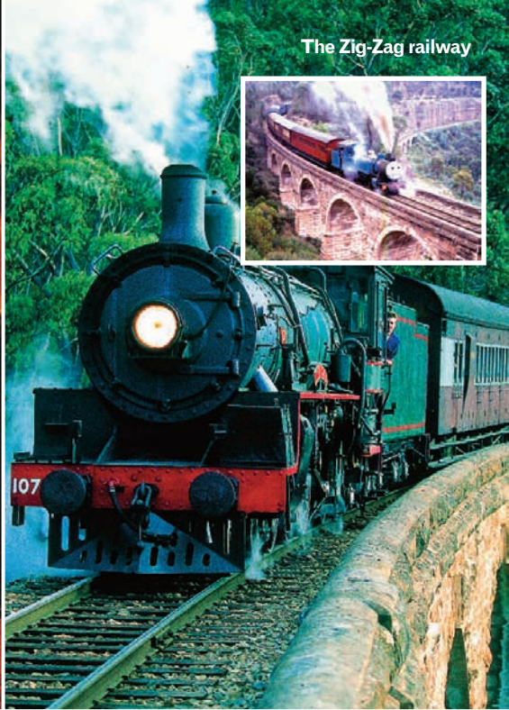
The Zig-Zag railway