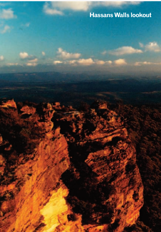
Hassans Walls lookout